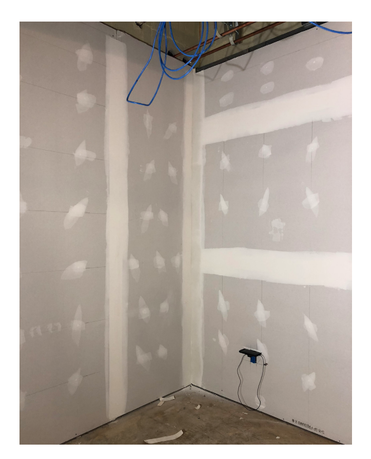
Figure 2. Documentation of on-site observation of gypsum wallboard installation and finishing shows varying board orientations and finishing at seams, corners, and screw locations.

To further exacerbate embedded waste practices, sub-contractors are not financially incentivized to create efficiencies and minimize waste. Their fee is based on purchased material quantities and, therefore, they do not benefit from conserving material by ordering more accurate material quantities or by making use of board cutoffs. They do financially benefit, however, by using large board sizes which decreases the number of seams that require finishing. This reduces timeconsuming and highly skilled finishing practices and, therefore, reduces labor costs.<sup>14</sup>