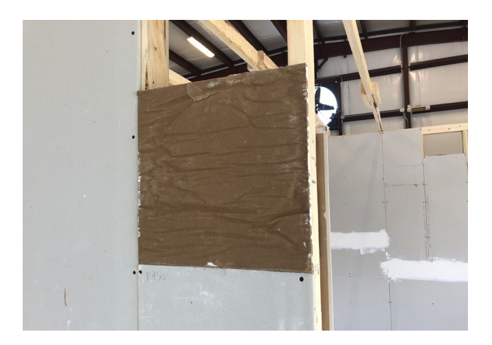
Figure 5. Cast panel prototype.

custom panels that replicated techniques used in large scale manufacturing of gypsum wallboard. In this work, a pedestrian version of stucco – quick-setting gypsum plaster and water – was poured or cast into molds lined with a paper backing. While the casting technique is still in development, this method allows for the creation of custom panels that can test a variety of module sizes as well as edge and surface conditions. The development of this process allows for the design and testing of gypsum wallboard product advances that address issues associated with installation and finishing practices as well as aesthetic concerns.