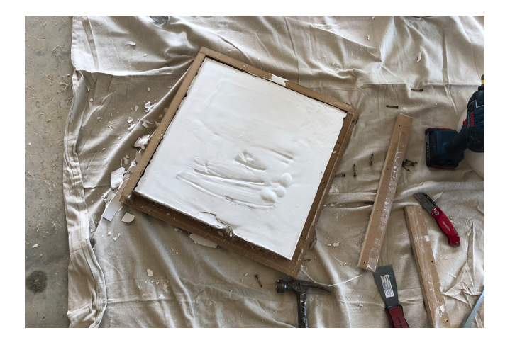
Figure 4. First gypsum cast in test mold.