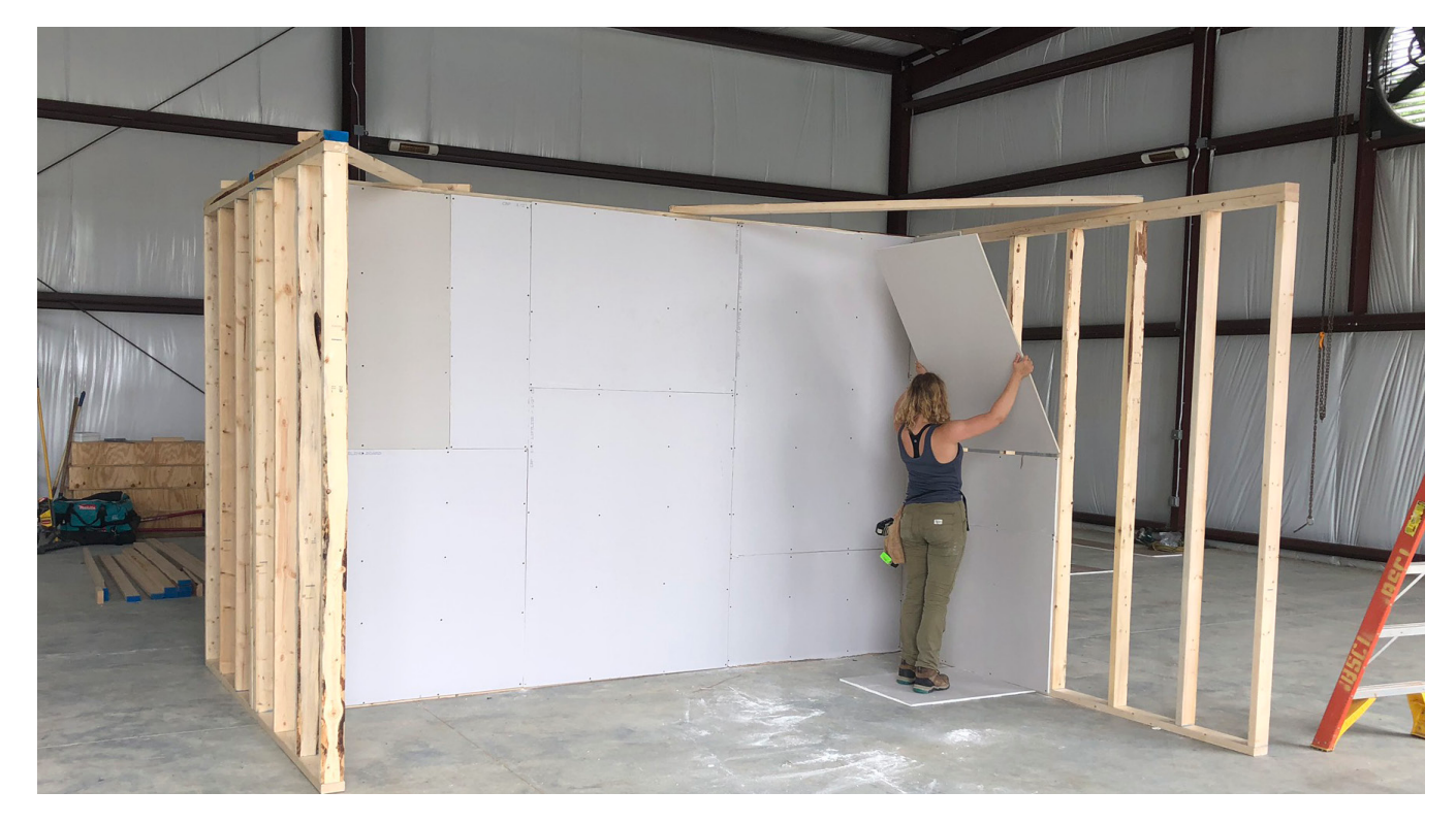
Figure 3. Full scale framing mock-up used to test various module sizes of gypsum wallboard.

testing, this research considers the modular size as well as edge and surface conditions of gypsum wallboard panels as points of redesign. The purpose of working within these parameters is to reduce on-site waste, allow for deconstruction and reuse or renewed feedstock, eliminate finishing practices, and reduce the dependency on highly skilled labor.