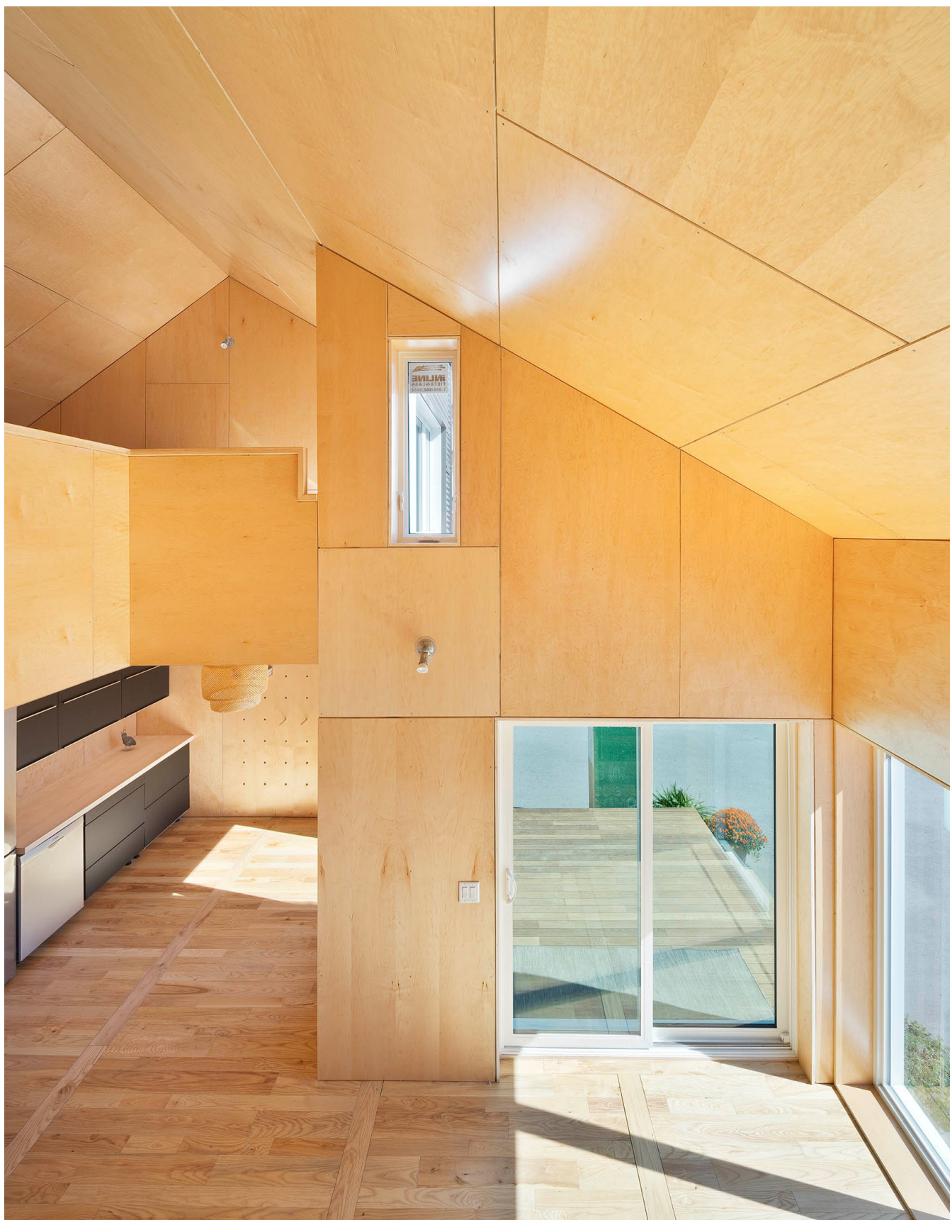
Figure 5. Image of Interior.