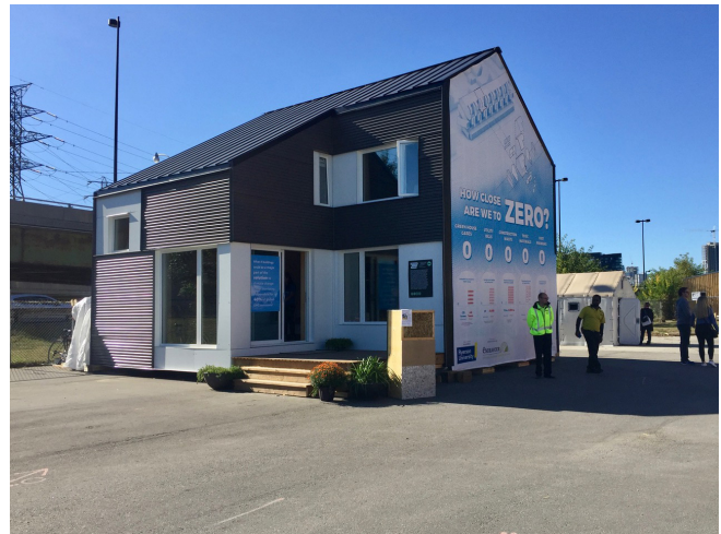
Figure 4. Finished installation at EditX Expo, Toronto 2017.

The entire insulated panel structure is organic. Students experimented with a range of alternative materials including wool, cork, and mycelium, a foam-like mushroom-derived insulation by Ecovative currently being used as packaging infill. Our lower wall panels are insulated with strawbale (built into the panels),