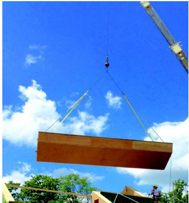
Figure 2. Multiple orientations + stack effect Drawing: Matt Ferguson.

Together we formed the ECOstudio to translate the design into construction. We were able to procure some donated materials and equipment from manufacturers and design funding from Ryerson. We eventually found a buyer of the finished house. We prototyped the prefabricated panel system and the Endeavour students and staff built the 1100 square foot house over the summer. Our Ryerson team provided design concept and details, energy modelling, systems design, project management and approvals drawings. The Endeavour students