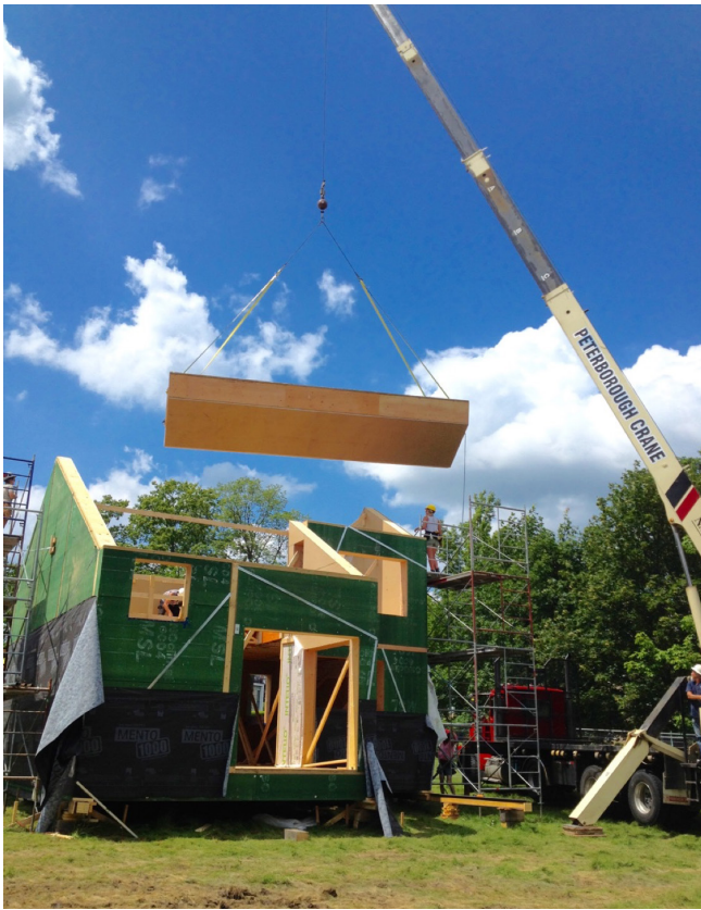
Figure 3. Craning prefab panels into place

costs. This also translates into a large carbon footprint for the cumulative transportation and temporary site heating costs. Off-site construction is particularly optimal for the short construction season in most of Canada and the northern US.