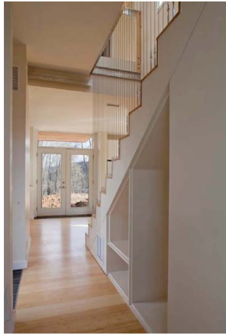
Figures 1 and 2: Exterior and interior views of ecoMOD4: the THRU house.

The research team has collaborated with Cardinal, as well as Southside Outreach from South Boston in Southside and People Incorporated from Abingdon in Southwestern Virginia to create a four-bedroom version of the design. The housing organizations, the modular homebuilder and the SIPs manufacturer receive the majority of the funding for materials, new technology and training.