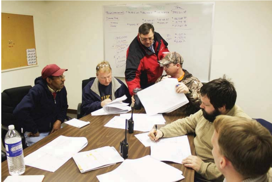
Figure 4: Cardinal Homes staff members discussing the ecoMOD South project.