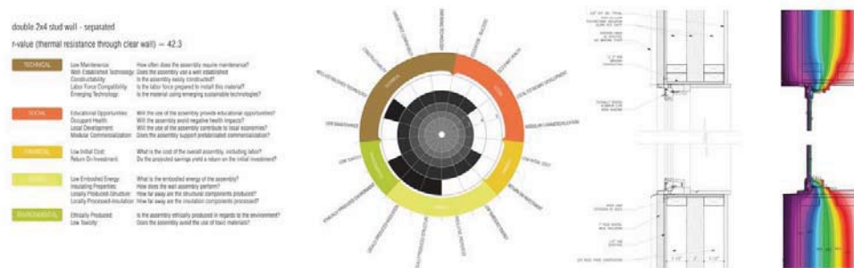
Figure 5: DAT diagram showing a possible wall system for ecoMOD South.

The driving goal for the development of the Decision Analysis Tool is to accumulate research on sustainable building components, and display this information in a freely accessed way. Comparable tools include the Pharos project, organized by the Healthy Building Network, which aims to increase product transparency by providing a score according to several “impact categories” to explain information to consumers, and ARUP’s SPeAR diagram, a propriety application used by ARUP consultants clarify sustainability priorities with a variety of clients. Besides the unique graphic interface that the team has developed, the DAT differs from these precedents in two major ways. First, it is a system that can be applied to any decision or situation. Already it has been used to assess the values of the different partners in the ecoMOD South project, and to evaluate complex components such as wall systems.