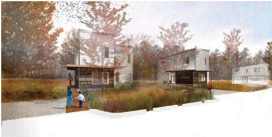
Figures 3: Exterior view of ecoMOD South homes shown on the South Boston, VA site.

Over a year and a half, the ecoMOD South research team adapted the ecoMOD4 design to become a four-bedroom, 1,800 square foot home [Figure 3]. In addition to the redesign process, the team critiqued the materials used in the prototype, and spent many months researching material choices, construction details, landscape design strategies, Passive House modeling, and created simulations of energy use, daylighting and thermal bridging. The effort is led by the ecoMOD Project Director, who works with three other faculty members with expertise in engineering, landscape architecture and building simulation. A PH certified consultant manages the PH modeling process, and a PH certified engineer designed the mechanical system.