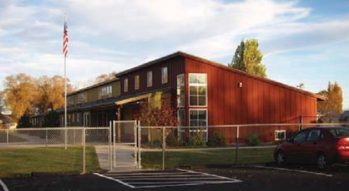
Figure 1: Redwood Early Education Center (left) and Harney County Early Childhood Center (right)