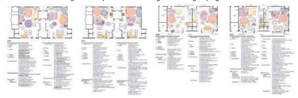
Figure 4: Furniture layouts: on the left, Redwood EEC Head Start classrooms in 2008 and 2012 | on the right, Harney County ECC Head Start classrooms for the 3's and the 4's in 2008 and 2012

In both centers, the classrooms are designed as simple volumes for easy teacher supervision, while maximizing the flexibility for children to engage a variety of learning activities that can change with different furniture arrangements. Within each classroom, the Head Start curriculum has a set of activity areas: circle, writing, reading, blocks, art, dramatic play, computers, manipulative play, math, science. Interviewing teachers and recording in photos and maps the different ways different teachers have laid out the activity areas measures the flexibility of space. Teachers in 2007/8 and 2012 reported finding the classrooms in both centers had enough flexibility for them to change furniture groupings.