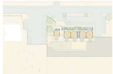
Figure 2: Site plans: Redwood EEC to the left, Harney County ECC to the right