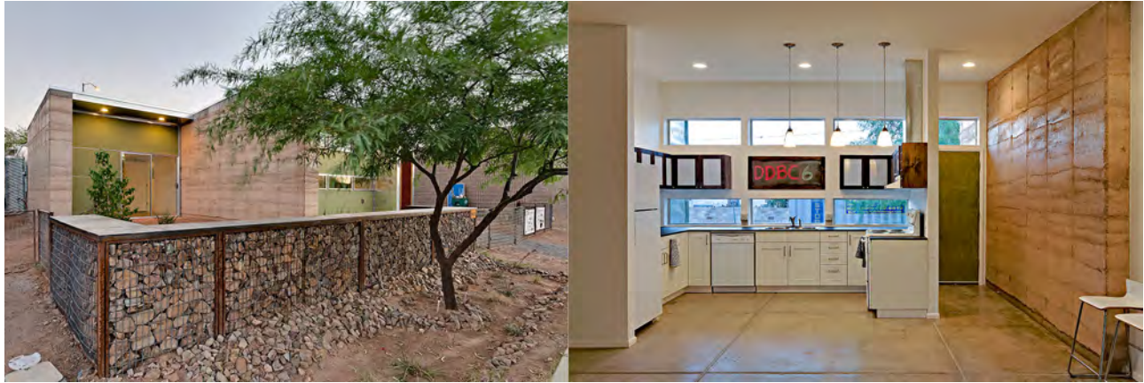
Figure 4: plit House; hybrid rammed earth thermal mass and insulative framed walls.