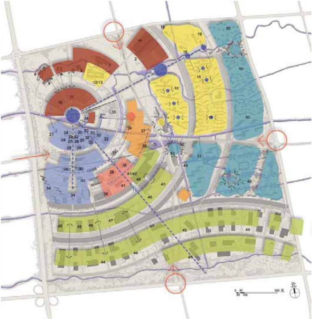
Figure 3 Shanghai International Medical Zone Master Plan

As the growth of the medical zone expands from this starting point in the northwest quadrant, we envision that the key organizing structure will be rings of green radiating outward through the site. Other landscape features will symbolically and functionally link the centre to nature. Like growth rings in a tree trunk, the green circular pattern will become the defining structure of ongoing growth.