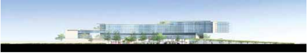
Figure 5 Shanghai International Medical Zone South Elevation