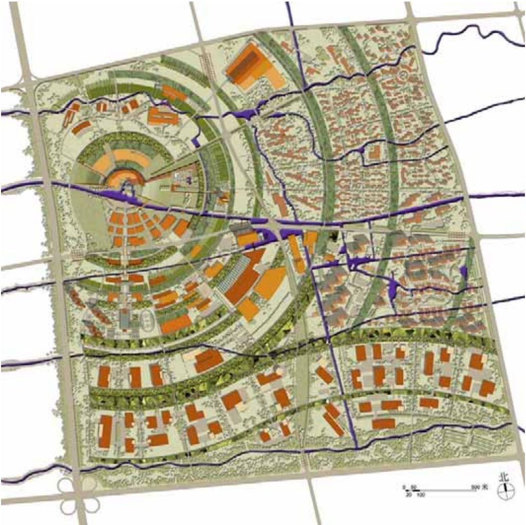
Figure 4 Shanghai International Medical Zone Site Plan

construction technology, such as green roofs, that contribute to a healthier environment for those, near or far away, that would be affected by the large building program. With such a large volume of new development, the medical garden can take advantage of large-scale methods of water and energy conservation and efficient use of resources.