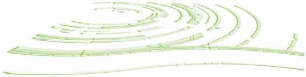
Figure 2 Shanghai International Medical Zone Graphic

medical research and development, and a large medical equipment manufacturing zone with associated research-and-development facilities. Housing for medical students and a neighbourhood for families will include town centres with children's daycare and early-education facilities.