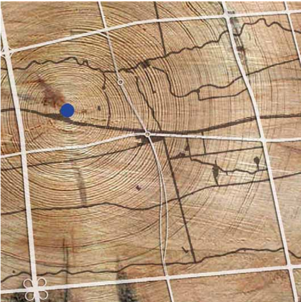
Figure 1 Shanghai International Medical Zone Concept

The complex will comprise two 1,000-bed teaching hospitals, specialty hospitals and clinics, a medical school planned for 10,000 students, a major rehabilitation centre, a centre for