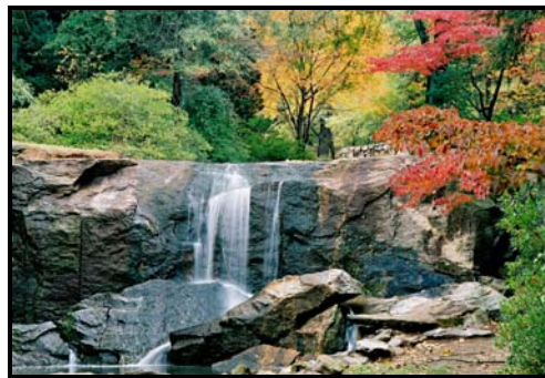
Fig1. Highest Ranking Image for Hospital In-patients © Bill Robertson

Hathorn and Nanda (2006) conducted an art preference study with inpatients in St. Luke's Episcopal Hospital in Houston, TX, and found that patients preferred nature scenes and representative images to stylized or abstract art, even when the latter were rated as bestsellers by different online art vendors. The study is yet another indicator that high-quality art, or even popular art, is not always appropriate art for healthcare settings. The study also showed that abstract images were not preferred, but generated more comments from patients. This indicates that evocative art is not synonymous with preferred art or, (one can hypothesize), restorative art.